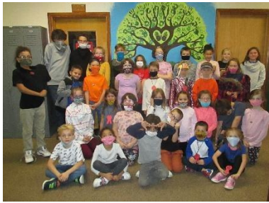
Tuesday – Wear your clothes backwards