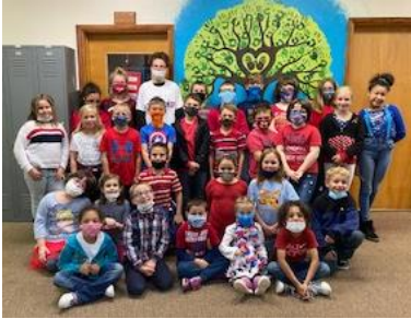
Monday – Red, White and Blue Day

This week the students watched a video and talked about what gives them a natural high. They loved participating in the dress-up days for the week.