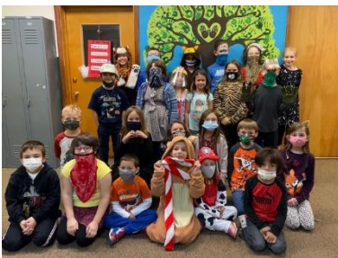
Friday – Animal/Animal Print Day