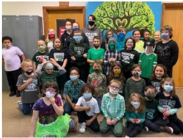
Wednesday – Wear school colors