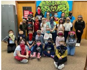
Thursday – Bandana Day